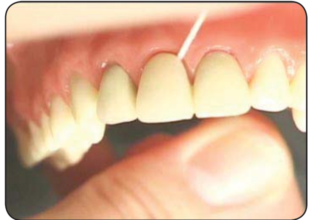
Superflossing a bridge