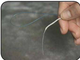
Superfloss showing stiff and fuzzy, tufted segments

Brush and floss your teeth and gums normally after each meal to keep your mouth healthy. Make sure to brush and floss the abutment teeth carefully to keep them strong and healthy.